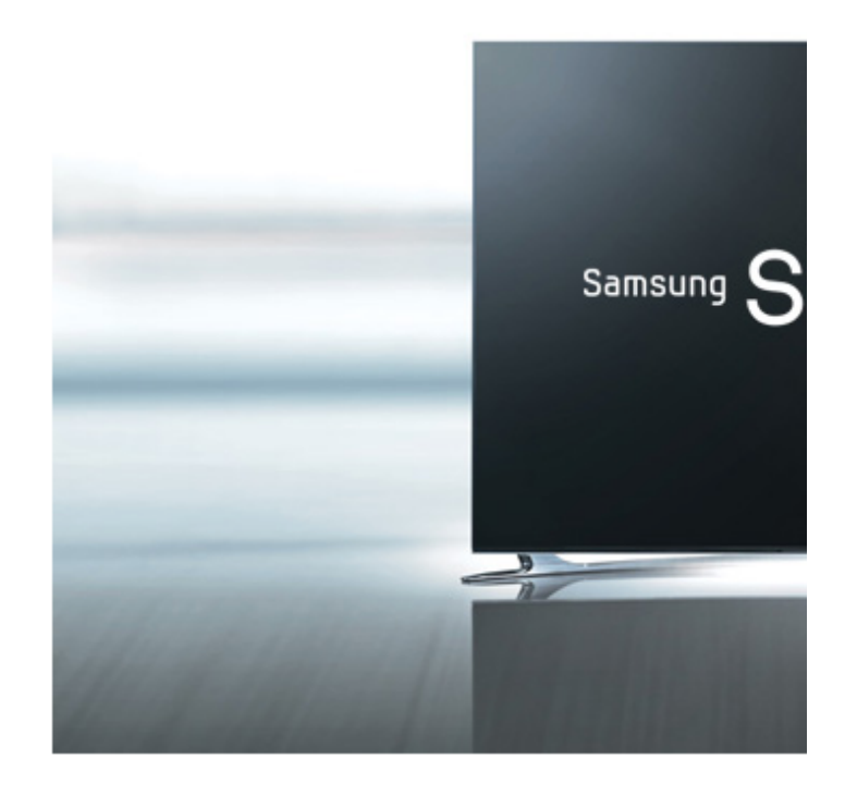
Orwell's 1984, which spied on citizens. Samsung SMART TV TV has never been this Smart